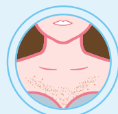
AGE SPOTS / SUN DAMAGE