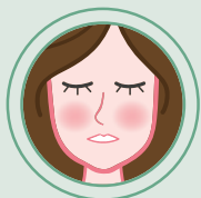
BENIGN VASCULAR LESIONS

Revivo offers a non-invasive solution with limited down-time and visible results after just a few sessions.