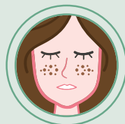
BENIGN PIGMENTED LESIONS